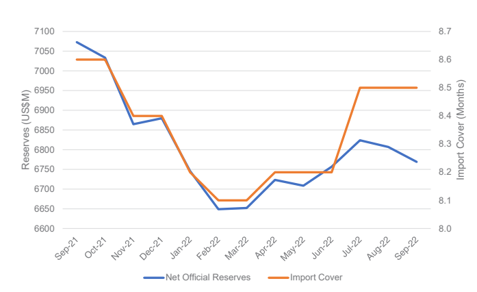
Figure 2: Trinidad and Tobago Net Official Reserves (US$M) and Import Cover (Months)

Net Official Reserves contracted by 4.3 percent y-o-y in September 2022 to US$6,769 million, representing 8.5 months of import cover (Refer to Figure 2). However, this was 0.2 percent higher than the level recorded in the second guarter (US$6,756.8 million or 8.2 months of import cover). In the third quarter of 2022, both the sale and purchase of foreign exchange by authorised dealers increased. Total sales by authorised dealers to the public increased by 26.9 percent y-o-y from US$1,316 million in the third quarter of 2021 to US$1,670 million in the third guarter of 2022. During the same period, the purchase of foreign currency from the public increased by 37.1 percent y-o-y compared to 52.5 percent y-o-y in the second quarter of 2022. Net sales of foreign currency fell from US$290.3 million in the third guarter of 2021 to US$264 million in the same period in 2022. The TT-US exchange rate remained at TT$6.78 per US$1.